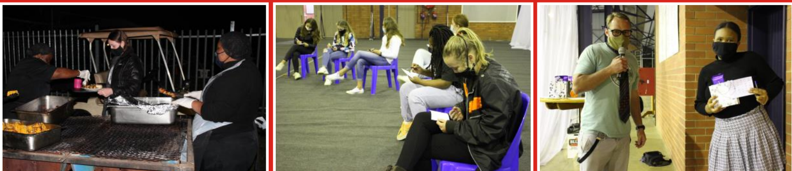
Grade 8 braai and bingo evening in MPC1