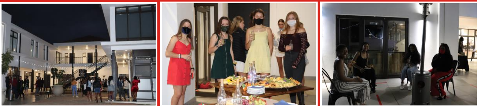
Grade 12 cocktail party in the Performing Arts Centre quad

Boarding came up with some creative events for the Grade 8s and 12s as they were unable to enjoy their regular sit-down, formal boarder dinners in the WJ Williams Centre due to it being utilised as an art room.