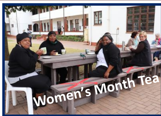
Women's Month Tea