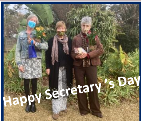
Happy Secretary's Day

What started out as a virtual run/walk to replace the annual Prep School sports day, turned into a whole school one-hour Saturday challenge that encouraged everyone to venture outdoors, get some exercise, and win points for their school house. Somerset accumulated the most points and an impressive 1559.34 km was covered by all participants.