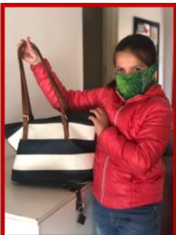
Bags for the Jes Foord Foundation