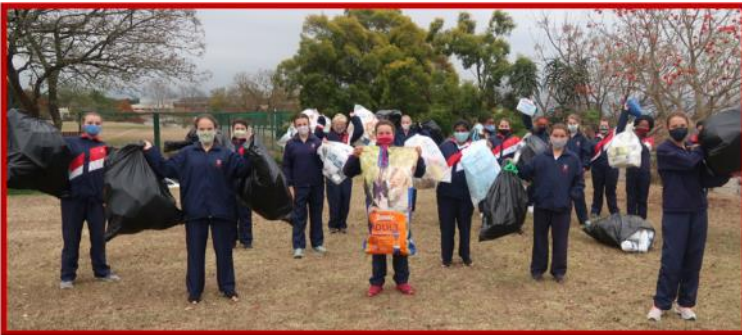
Grade 6's amazing plastic recycling drive