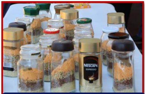
Meals in a Jar

♥ ♥ ♥ "The purpose of human life is to serve, to show compassion and the will to help others and their community." Albert Schweitzer